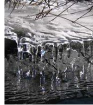
Mullica River, NJ