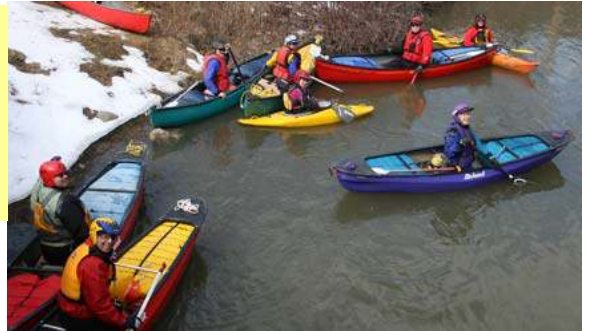
Tohickon Creek, PA. Spring Release—Even a major snowstorm didn't stop some folks! Very few boaters on Sunday. Bright clear day, and yes very cold