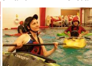
Jordan & Jordan

AMC's NJIT pool sessions run from February to April of each year. At each session all equipment is provided. A nominal fee is charged for each class. Qualified instruction is available at no cost; and many of our instructors are ACA certified.