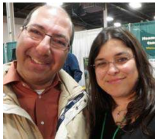
Ara, Neval Two clubs, two CEO's