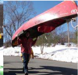
more boat traffic