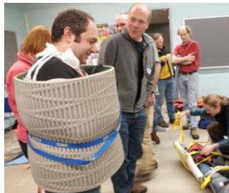
Jordan's full body splint

WFA the best way to be prepared is to practice before an emergency situation arises. Play the WFA matching game p. 4