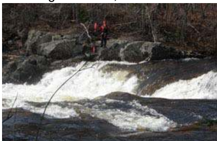
Rey scouting Horseshoe Falls