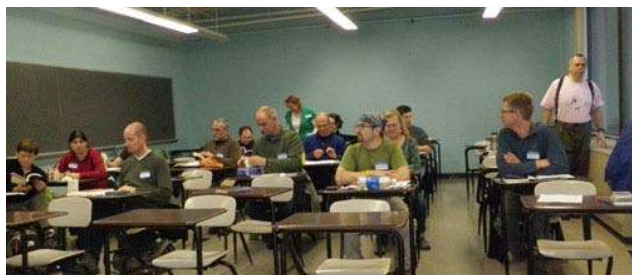
Our classroom at Newark's NJIT