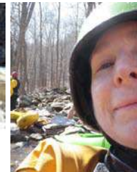
Send in YOUR pics!