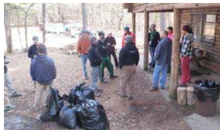
Outside Harden cabin