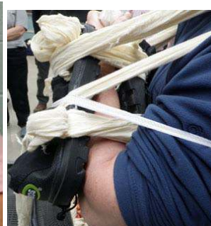
Many ways to splint an arm Look closely – even use your shoes!