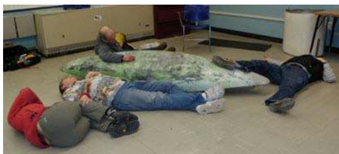
"River" accident scene – Carnage! What would you do?

WFA the best way to be prepared is to practice before an emergency situation arises. Play the WFA matching game p. 4