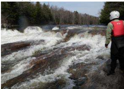
Jill looking up-stream