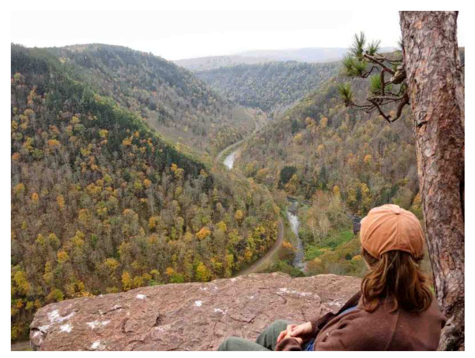
Admiring Pine Creek Gorge, the Grand Canyon of PA