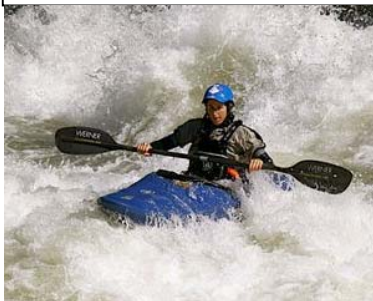
Pamina on the Gauley, West VA