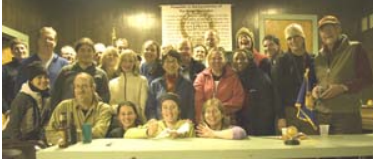
Group photo of AMC members at Farmington River. NY-NoJ & New Hampshire Chapter.

Trip a Go-Go: New Boston section of the Farmington River Dates: Oct 18-19 & Oct 25-26, 2008